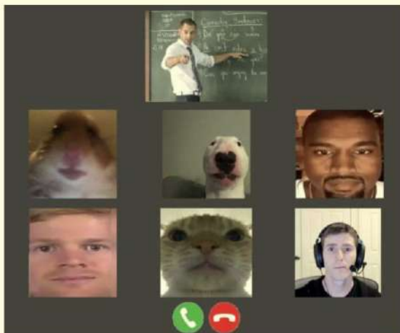
Fig. 2 Online classes

Last year, a new genre - "Novels" was added to the original ACGS. Light Novels are the origin of many animations and comics. They are a style of novels which primarily targets high school and college students. Its illustrations are often the inspirations of many popular animation styles used in anime and other kinds of media. Light novels help students improve their writing skills, as they are usually composed of well-written storylines, unexpected foreshadowing and cliffhangers which can also greatly improve the readers' writing. We hope that by introducing the genre of literature that is Light Novels to new students, more people will appreciate their impressive stories and the worlds they describe.