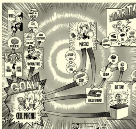
Fig. 1 A panel from the original Dr. Stone comic

Such programs provide educational information and knowledge about Physics, Chemistry and Biology on anime viewing days. Other than that, we also hold regular gaming events for students to have fun and relieve stress from the intense school work. We do our best to provide an environment for students to communicate and socialize with others, while maximizing the benefits from gaming such as improving problem-solving and collaborative skills. We hope that with these events, students can concentrate on their studies just as much